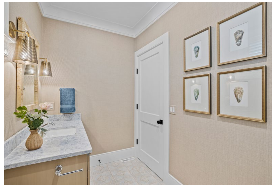
Left: Sliding glass doors to the outside along with coastal-inspired lighting from Hudson Valley Lighting brighten the open kitchen and dining space.