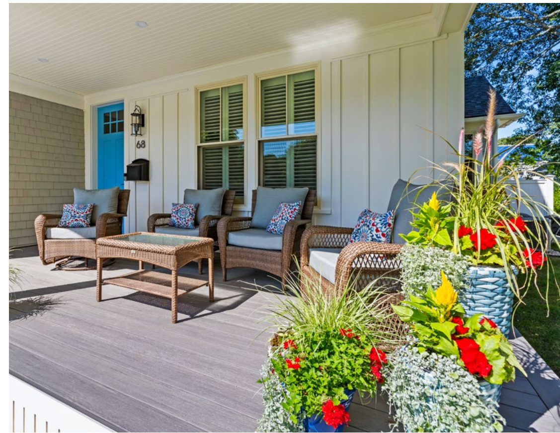
Both the shaded front porch, above, and the sunny and spacious back patio, below, provide the family with ample opportunity for outdoor relaxing and entertaining.