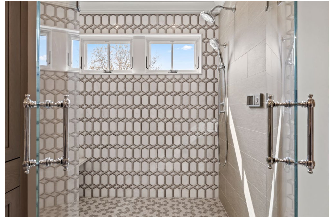
The project team's collaboration resulted in a gorgeous primary bath with white oak cabinetry, quartz countertops, geometric mosaic tile on the focal wall, and porcelain octagon-shaped shower floor tile.