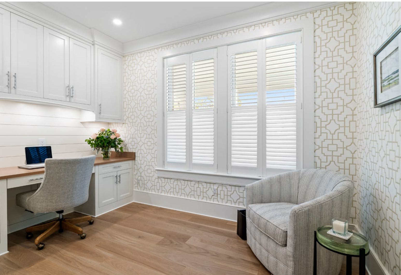
A large-scale trellis-patterned wallpaper in a neutral color with a comfortable swivel chair creates a classic and bright home office in which to work or read.